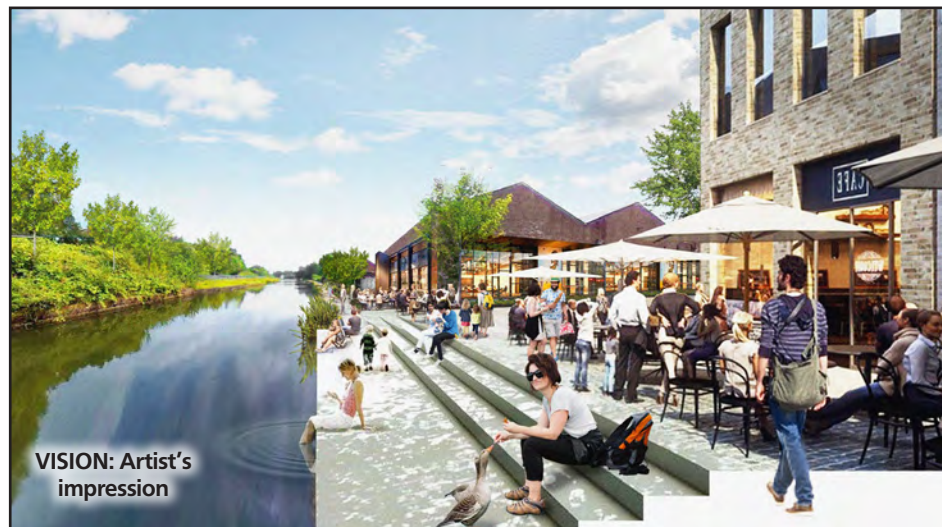
VISION: Artist's impression

Stretford scheme gets a £17m boost from government